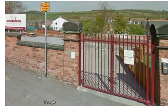
Cougars and FS 2 access and exit gate

If your child is late in the morning then please access the school site via the school office on Low Road.