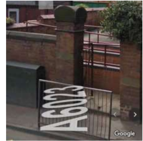
Year 1 and Jaguars access and exit gate

If your child is late in the morning then please access the school site via the school office on Low Road.