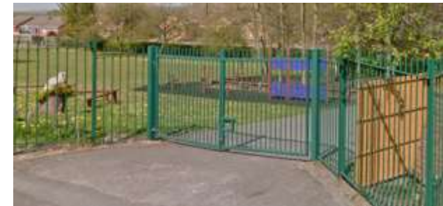
Year 2 and Pumas access and exit gate

If your child is late in the morning then please access the school site via the school office on Low Road.