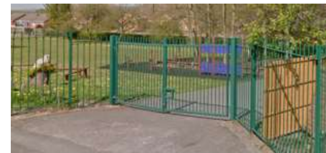
Year 2 and Pumas access and exit