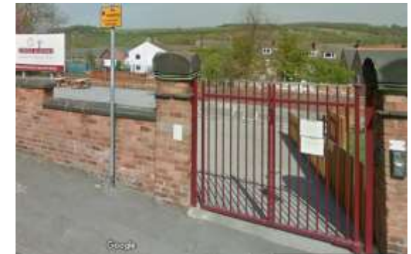
FS2 and Cougars access and exit

If your child is late in the morning then please access the school site via the school office on Low Road.